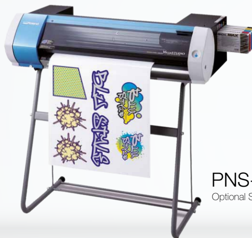
PNS-24 Optional Stand