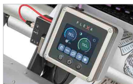
Automatic vertical alignment control panel