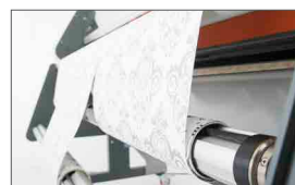
Front rewinding system: it rewinds the cut media up to three smaller rolls (optional)