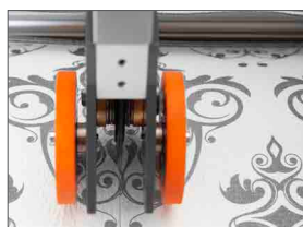
Slimline lengthwise rotary crush cutter, single or twin, (optional)