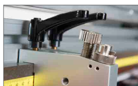
Fine pressure adjustment (according to the types of material)