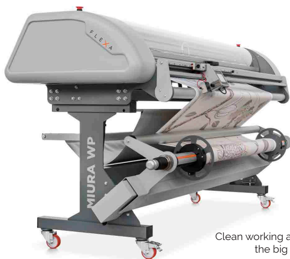
Clean working area thanks to the big waste basket