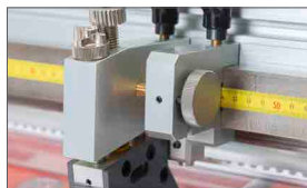
Fine positioning of the cutting blades (standard)